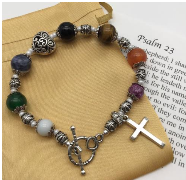
An idea of what your bracelet might look like.